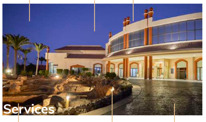
24-hour doctor's clinic